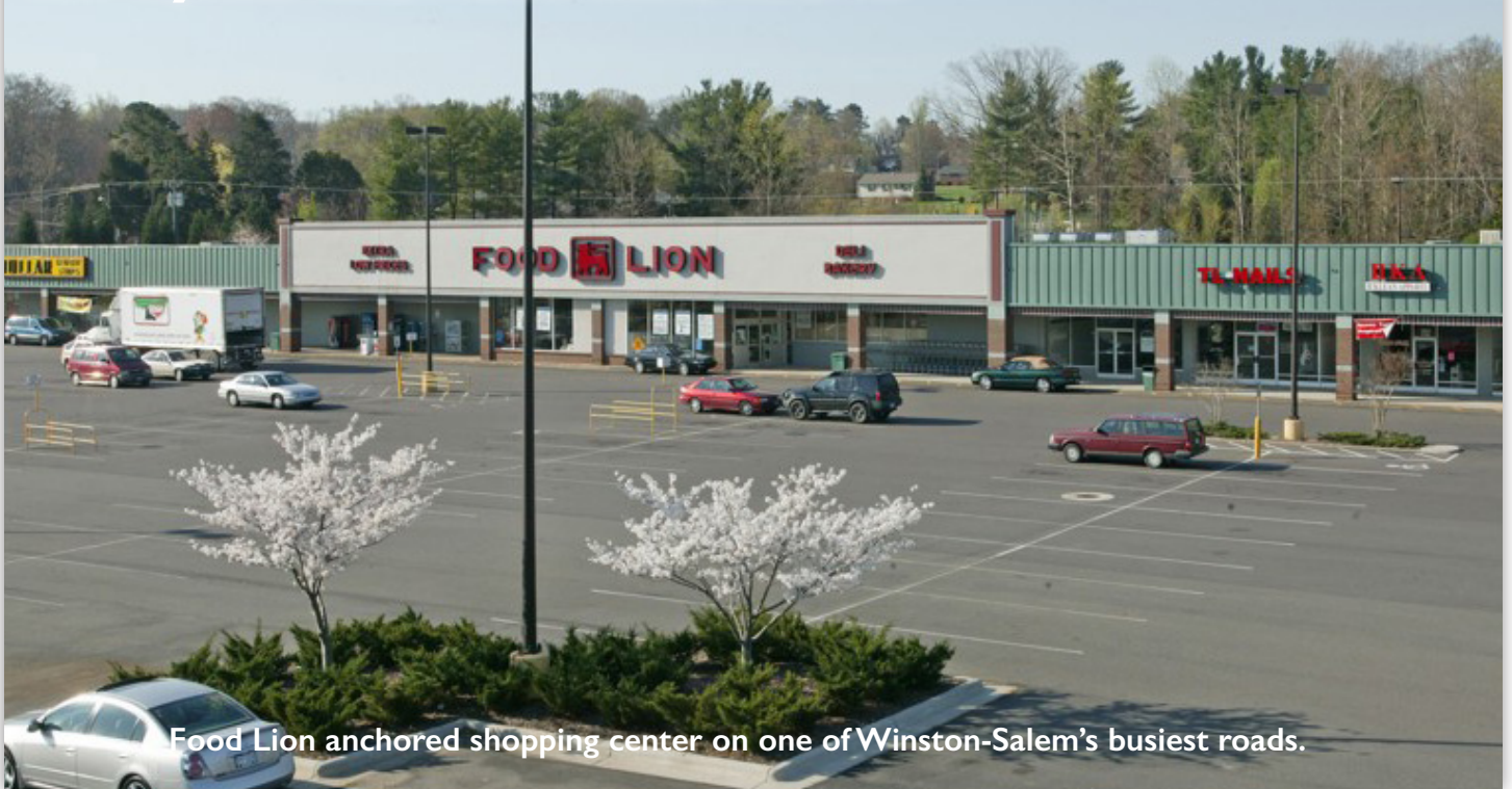
Food Lion anchored shopping center on one of Winston-Salem's busiest roads.

3800 Reynolda Road, Winston-Salem, NC 27106